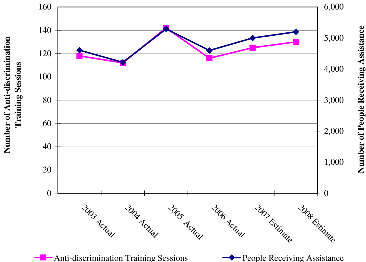
Exhibit 1 Anti-discrimination Training Fiscal 2003-2008

Source: Maryland Commission on Human Relations