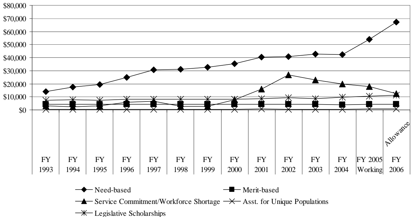
Exhibit 4 Scholarship Funding by Type of Aid Fiscal 1993 – 2006